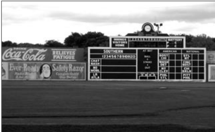
Scoreboard at Rickwood Field

For more information about joining WEMA and to learn more about the BEACON Program and MSB please visit www.mainstreetbham.org or call MSB at (205) 595-0562.