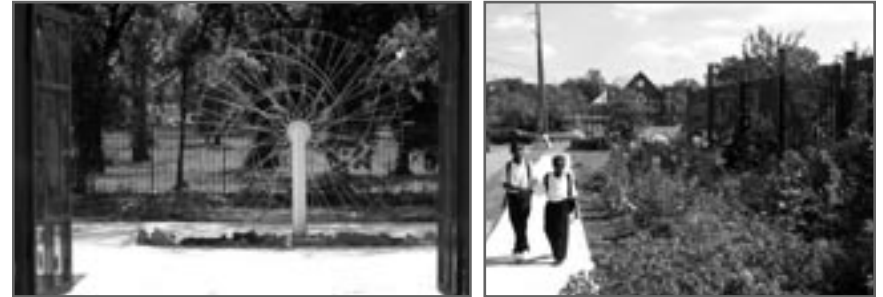
Healing Garden, Baptist Princeton Medical Center (10th street SW and Tuscaloosa Avenue)